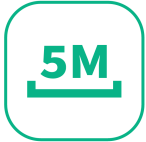
5m Pick-up Range