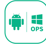
Android or Windows